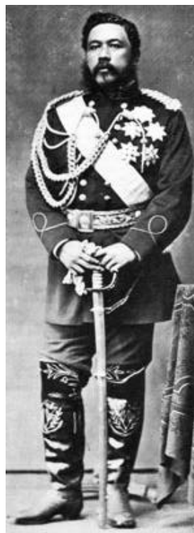
King David Kalakaua

C Aia i He'eia la .....G7...C vamp: G7-C-G7-C I ka nalu e he'e ana Ea, ea, ea, ea C He'e ana i ka muku la .....G7 C vamp Ho'i ana i ka lala Ea, ea, ea, ea C A na'u i kikaha la .....G7 C vamp 'O ia ae kai Ea, ea, ea, ea C A he kuhihewa ko'u la .....G7 C vamp Aia i ka poli Ea, ea, ea, ea C Ha'ina ka puana la .....G7 C vamp O Halala i ka nuku manu Ea, ea, ea, ea (optional Ha'ina) Ha'ina mai ka puana la O Kaleleonalani Ea, ea, ea, ea